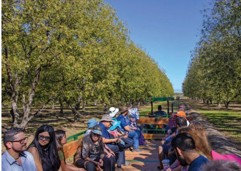
Pecan-cracking contests and wagon rides through orchards make for an enjoyable day at the annual Sahuarita Pecan Festival.

Her goal was to retire by the time she turned 70, which she did. "But now I wish I had done it earlier," she says. "There are so many activities around here." She belongs to a mahjong group,