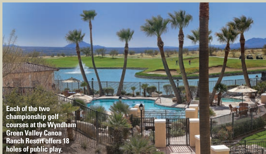
Each of the two championship golf courses at the Wyndham Green Valley Canoa Ranch Resort offers 18 holes of public play.

walkability rating of 11 out of 100, or “car dependent,” according to WalkScore.com . Neighborhoods will vary.