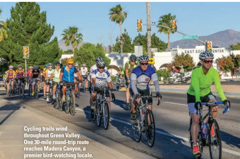
Cycling trails wind throughout Green Valley. One 30-mile round-trip route reaches Madera Canyon, a premier bird-watching locale.

Plus, they discovered they could buy a larger, new house for the same sales price of their older Salem home.