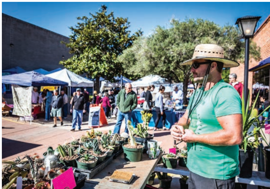
At the weekly Green Valley Village Farmers and Artisans Market, vendors hawk everything from Sonoran hot dogs to succulents and cactuses.

Plus, volunteer work is encouraged and supported. "There's a lot of volunteerism here to run all the activities in