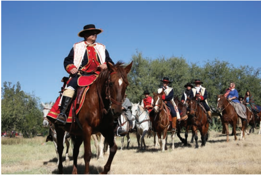
Tubac Presidio State Historic Park hosts the annual Anza Days event, when costumed riders re-enact the start of Spanish explorer Juan Bautista de Anza's 1775 expedition.